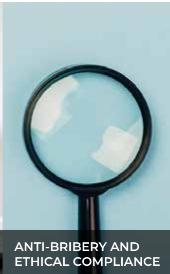
ANTI-BRIBERY AND ETHICAL COMPLIANCE

NetworkPA the network of new opportunities for suppliers