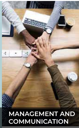
MANAGEMENT AND COMMUNICATION

Legality Whistleblowing for compliant whistleblowing reporting management